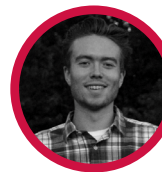
Logan Biomedical Engineering '21 Chaplaincy at UW Hospital