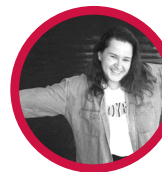
Delilah Music Education '22 Contemplative Prayer