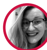
Sami Environmental Sciences '22